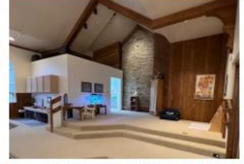
The entire chancel area is their Peace Comer. A calm area in the classroom where several children can relax.