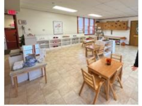
The Practical Life area adjoins the classroom and provides a spacious area for the children.