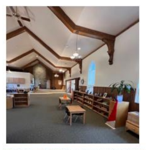
Mid-Mitten is fortunate to have a spacious classroom as well as an outdoor area with fruit trees and garden.

tremendously in the purchase of some new materials. It was extremely important to me to have good quality Montessori materials, and although we may not have everything I would like...yet, we have enough to run a program efficiently.