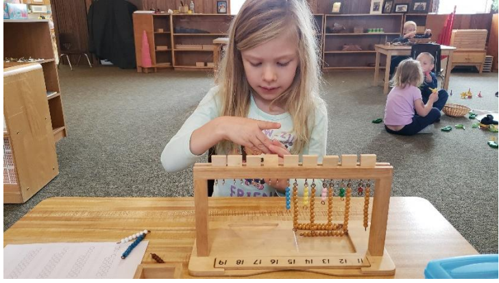
Locataed near the Isabella Reservation, Mid-Mitten Montessori celebrates Native American heritage while providing a caring educational community for children.