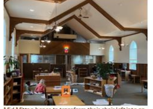
Mid Mitten hopes to transform their choir loftinto an observation area, hoping to introduce CMU students to

August of 2022. Formerly White Pine Montessori, we are located in the heart of downtown