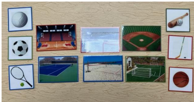
Lucas' Sports Work